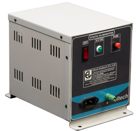
eltech - 331 Power supply

The Eltech 331 power unit is the most useful static control equipment. The instrument produces high voltage, low current in a controlled and safe manner. It's compact size and structure is suitable for most industrial environments. The defect free products and quality ensures efficient use and maximum customer satisfaction. We have designed the Eltech 331 power supply and the different discharge bars for active discharging of disruptive static charges, which develop during the production processes. The discharge bars and the power supply are used primarily in cases where disruptive static charges on fast moving material webs impair production processes and required to be eliminated.