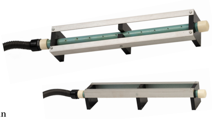
eltech - SSPL High Performance Shockless Electrode

Supply voltage : 230 V AC , 50 Hz , 25 Watts Output voltage : 5.5 kv Output short circuit current : (Ik) < 3.5 mA Power consumption : approx. 50 VA Maximum load : 10 m (HV cable incl. electrode) Frequency : 50 - 60 Hz Mains cable length : approx. 2.5 meter with earthing -pin plug. Distance : 25mm Maximum Weight : 8 kg (eltech - 331) Dimension : 168mm L x 260mm W x 190mm H (eltech 331)