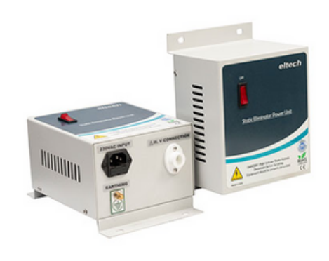
eltech - 331 Power supply

The Eltech 331 power unit is the most useful static control equipment. The instrument produces high voltage, low current in a controlled and safe manner. It's compact size and structure is suitable for most industrial environments. The defect free products and quality ensures efficient use and maximum customer satisfaction.We have designed the Eltech 331 power supply and the different discharge bars for active discharging of disruptive static charges, which develop during the production processes. The discharge bars and the power supply are used primarily in cases where disruptive static charges on fast moving material webs impair production processes and required to be eliminated.